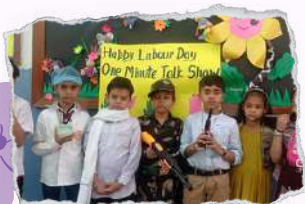
• One Minute Talk