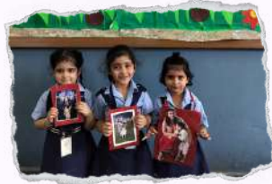
Thank You Cards Making

Overall, these activities likely contributed to a sense of unity & recognition among participants, emphasizing the importance of honoring and supporting the labour force.