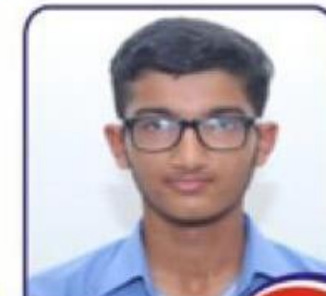
CHITWAN SCIENCE 97.6%