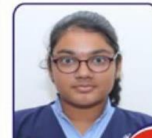
KAVYA COMMERCE 99%